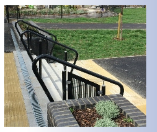
Stargard external balustrade

SG System Products Limited 22 Wharfedale Road Ipswich IP1 4JP