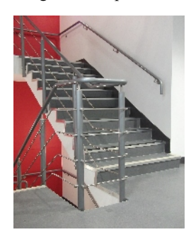
Stargard with stainless steel "Running rails"