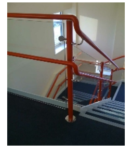
Glazed Stargard with "double" handrail and glass infill panels

Balusters can be PVC sleeved, powder coated, galvanised steel, or stainless steel. Stargard can also be fitted to Glassrail structural glass