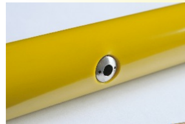
LED INSERT into “warm to the touch” handrail