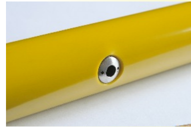
LED INSERT into “warm to the touch” handrail