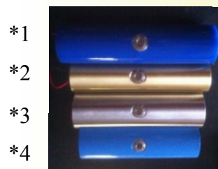
LED INSERT HANDRAIL OPTIONS