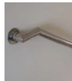
Wall handrail with wall end plate