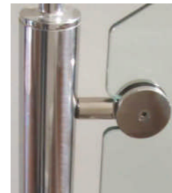
Toughened glass infill