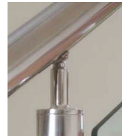
Standard baluster top