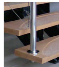
Wooden tread fixing

Handrail is either 50mm or 42mm diameter and the balusters are 50mm diameter. For internal applications grade 304 stainless steel is used and for external, grade 316 stainless. The tube is available in either fine satin or bright finish, whilst the fittings are bright polished as standard, but can be satinised if required. Brass fittings are available for a more distinctive look.