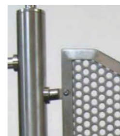
Perforated sheet infill