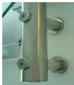
Standard side fixing