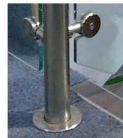
Pocket fixed balustrade with cover plate