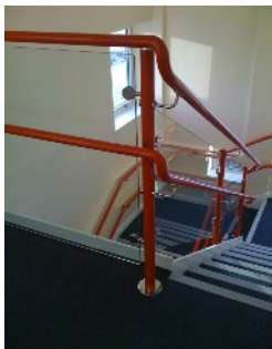
Glazed Stargard with “double” handrail and glass infill panels

Design: Stargard handrail meets the requirements of BS 8300 and building regs part M and requires the minimum of maintenance