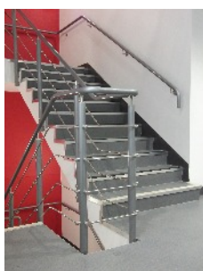
Stargard with stainless steel “Running rails”