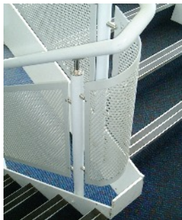
Stargard with perforated sheet infill panels