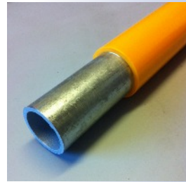
4 mm (4,000 microns) thick PVC over galvanised steel tube