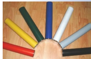
Stargard Standard colours